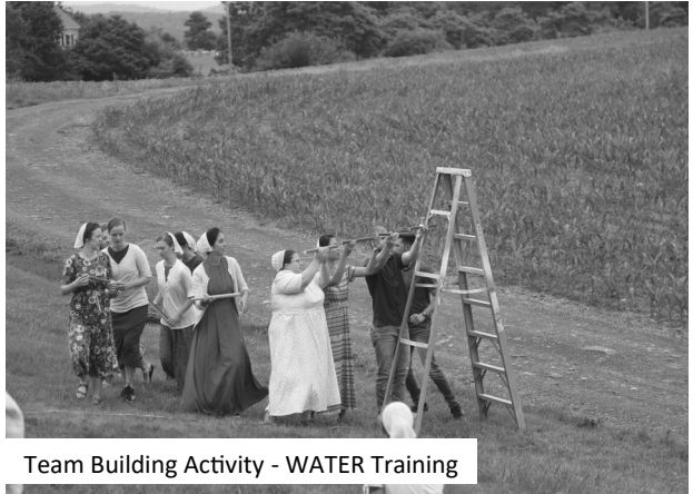
Team Building Activity - WATER Training