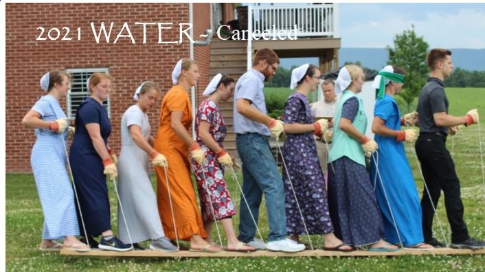
Family Week Count: 235 (including staff)

Colorado, Florida, Georgia, Illinois, Indiana, Iowa, Maine, Massachusetts, Mississippi, Nebraska, New York, North Carolina, Ohio, Pennsylvania, Texas, Utah, Virginia, Wisconsin, Wyoming