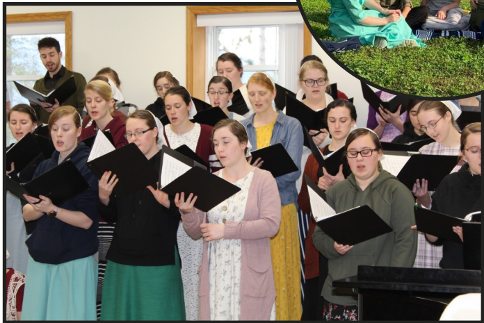
Weeks of choir tour throughout the year - 7 1/2

Number of Students This Year: 168 Number of Student Terms: 256 States Represented: 23 Countries represented: Belize, Canada, Chile